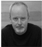
MICHAEL ROBOTHAM In conversation with MARGARET POMERANZ

Words at Wagstaffe, a one-day literary event held in partnership between Words on the Waves Writers Festival and The Bouddi Society, will return to Wagstaffe Hall on Saturday 16 March 2024. With a spotlight on thriller and crime writers, our all-star line-up includes: